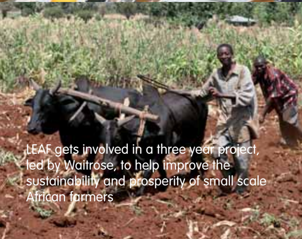
LEAF gets involved in a three year project, led by Waitrose, to help improve the sustainability and prosperity of small scale African farmers