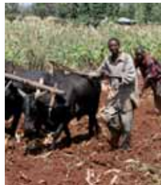
LEAF gets involved in an exciting three year project, led by Waitrose to help improve the prosperity of small scale African farmers.