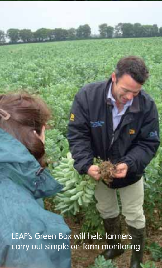
LEAF's Green Box will help farmers carry out simple on-farm monitoring