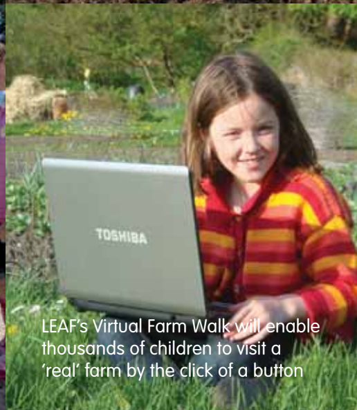
LEAF's Virtual Farm Walk will enable thousands of children to visit a 'real' farm by the click of a button