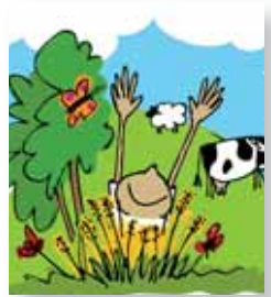
LEAF and The Sensory Trust are awarded a Big Lottery Grant for a flagship project to get young people, disabled groups and older people out onto farms.