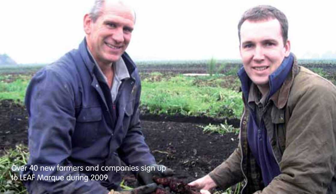
Over 40 new farmers and companies sign up to LEAF Marque during 2009