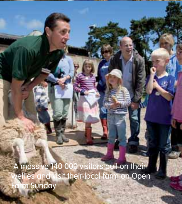
A massive 140 000 visitors pull on their wellies and visit their local farm on Open Farm Sunday