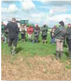
LEAF Demonstration Farmers get together in Wiltshire for our annual training event.