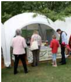
LEAF has a stand at the Waitrose Food Festival, Cereals and the Royal Highland Show – it is great to meet up with lots of LEAF members and Demonstration Farmers.