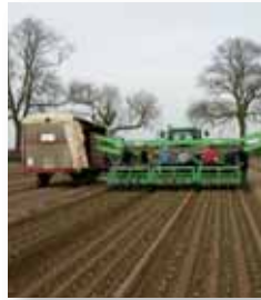
LEAF and FWAG join forces on a new initiative to help farmers become LEAF Marque accredited.