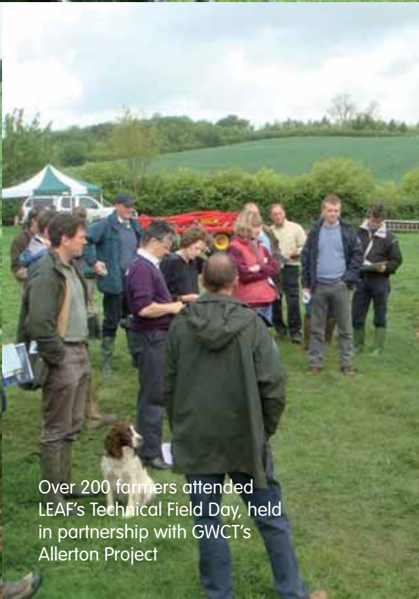
Over 200 farmers attended LEAF's Technical Field Day, held in partnership with GWCT's Allerton Project