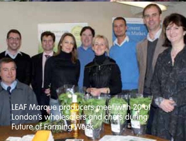
LEAF Marque producers meet with 20 of London's wholesalers and chefs during Future of Farming Week