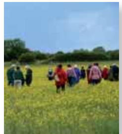
LEAF continues to host hundreds of visits to its Demonstration Farms throughout the year so people can learn about sustainable farming.