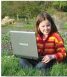
LEAF's updated Virtual Farm Walk goes live! Aimed at 7-11 year olds it takes visitors on a guided tour of an environmentally friendly farm.